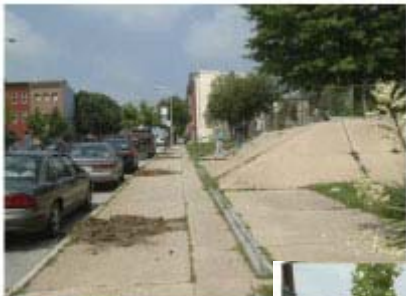
A city street before street trees were planted.

Since 1984, Parks & People Foundation has worked to improve the quality of life in Baltimore’s neighborhoods. Their staff, volunteers and partners in the community have developed innovative solutions to issues facing the city including the restoration of neighborhoods and their natural resources as well as the academic enrichment and motivation of their children. Parks & People Foundation assists communities in planting trees and creating parks and gardens; it awards grants to community groups for their greening projects; and it helps train and mobilize community organizations and residents to become park “friends” and help care for and maintain city parks.