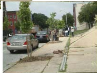
And after, as Parks & People, along with volunteers, plant trees along the sidewalk.